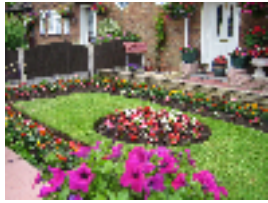
Overall Winner: Best Front & Rear Gardens