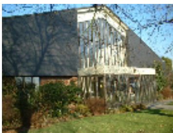
Chasetown Methodist Church

The Town Council's Christmas Service and the Civic Service were held at Chasetown Methodist Church, Queen Street, Chasetown.