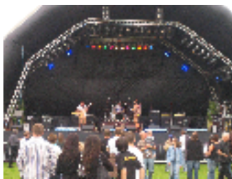
One of the local bands performing at the "Wakes Unsigned" 2008

The now traditional "Family Fun Day" took place on the Saturday afternoon but regrettably the evening "Proms in the Park" had to be cancelled at the last moment due to heavy rain.