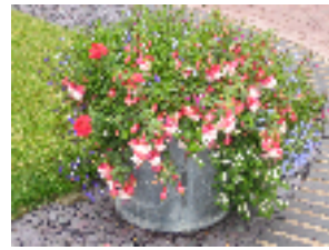
Winner: Best Container or Trough

Preparations are well advanced for the 2009 competition and the Town Council welcomes two new sponsors: Staffordshire Police (Chasetown Police Station) and HomeZone Living. Entry Forms can be downloaded from our website ( www.burntwood-tc.gov.uk ); collected in person from our office or requested by telephone, email or letter.